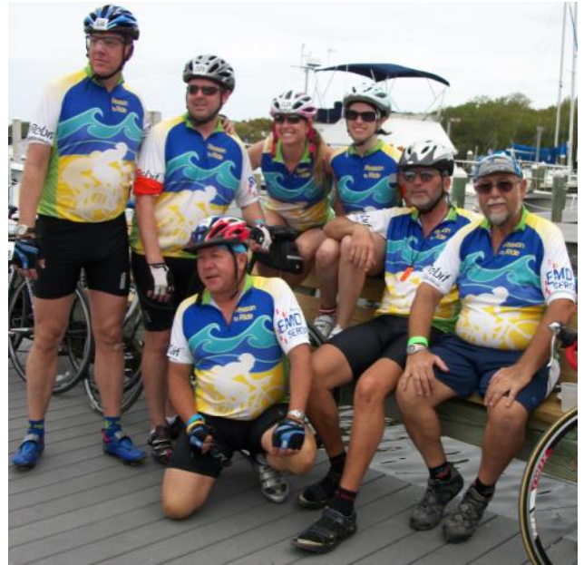
Last year's MS team posed at the John Pennekamp