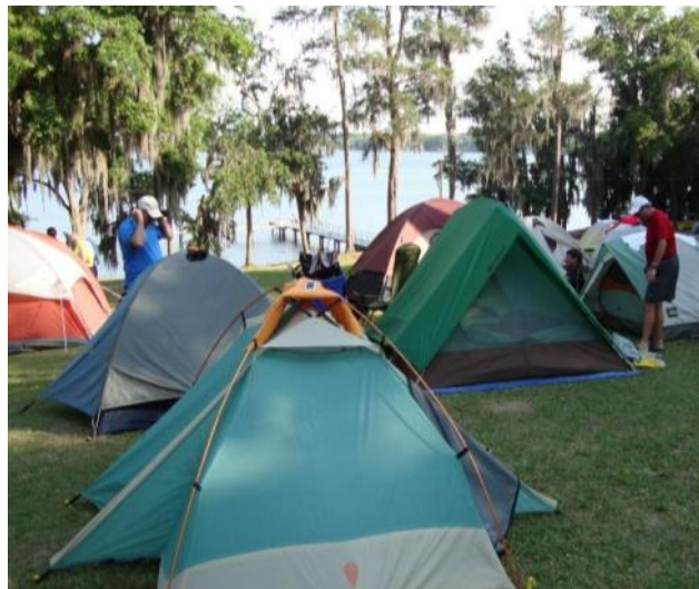
Riders enjoyed the Cherry Lake campsite during Bike Safari of North Florida and South Georgia.

Visit www.cyclesouthcarolina.org for more information.