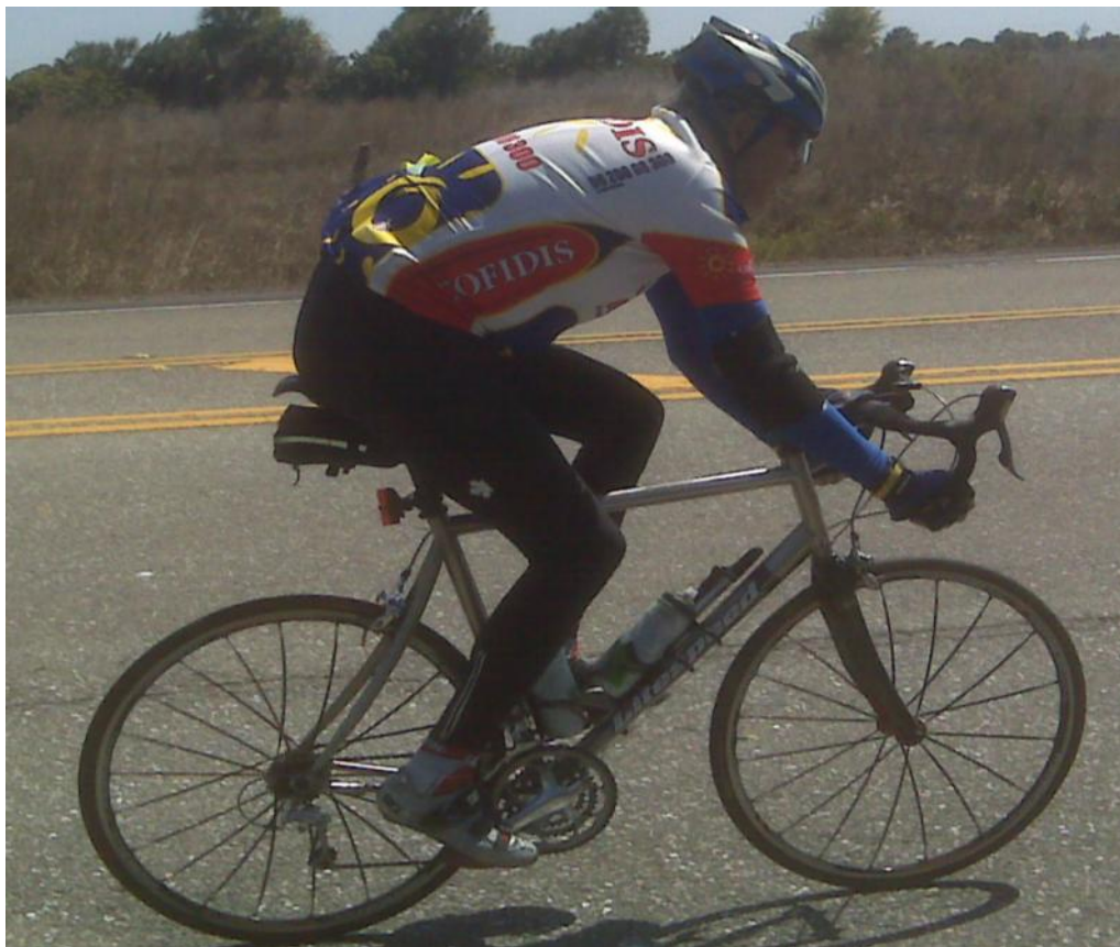
Zoom, zoom! Riders completed their 30 to 100 mile routes at full speed as they zipped into Buckingham Park for the finish of the Royal Palm Classic.