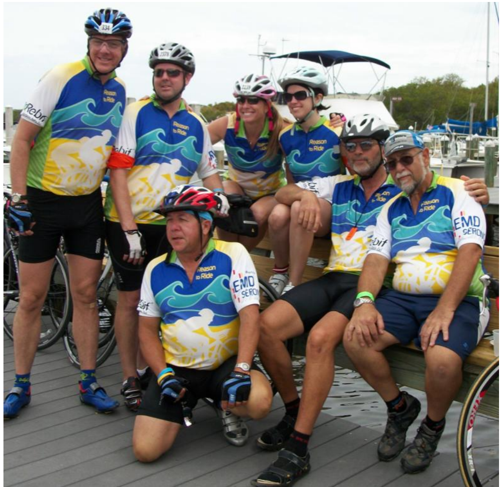
Sitting at the dock of the bay: The Caloosa Riders team enjoyed a moment together at the John Pennekamp State Park in Key Largo.

They next day they enjoyed lunch at a Cuban café.