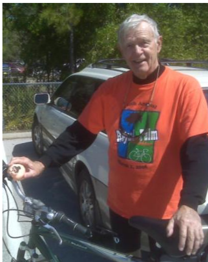
Above, riders braved nearly freezing temperatures to enjoy the Royal Palm Classic March 7 that started at Buckingham Park and wound through Lehigh and other parts of East Lee County. The day warmed up nicely enough and shortly after the ride, cyclists enjoyed a picnic lunch. Much of the day's success can be credited to the efforts of volunteers such as those picture on the right.