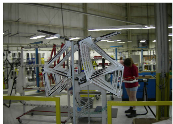
Frames on the factory floor