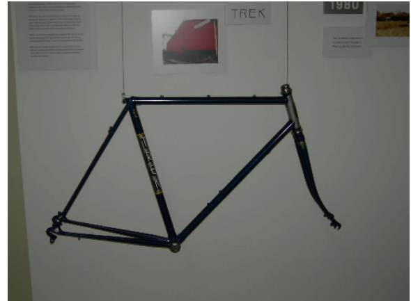
An early TREK touring frame

Visit the TREK web site: www.trekbikes.com/us/en/company/factory_tour/ for current tour information.