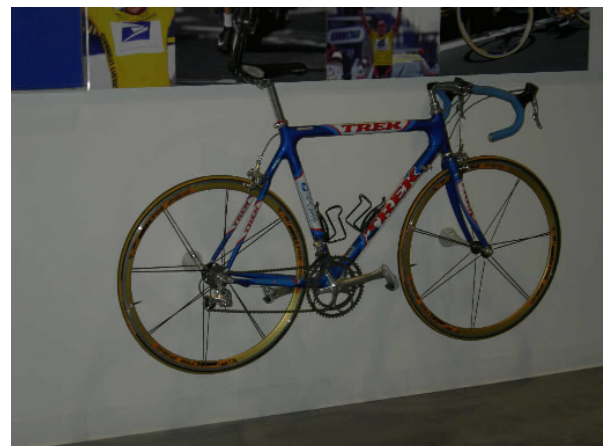
TREK ridden by Lance Armstrong on the Tour de France